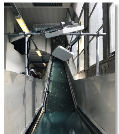
- RFID conveyor -

The expertise of Coppernic's engineers and technicians allowed us to innovate and implement customised solutions to optimise laundry monitoring for these companies.