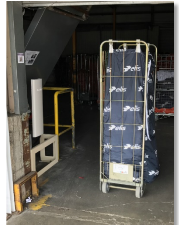
- Receiving area with xPortal RAIN RFID reader -

This means the company can know exactly how many items are available or have been returned and are on site in real time.